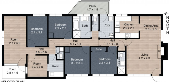
//FLOOR PLAN Ground Floor

Whilst every attempt has been made to ensure the accuracy of the floor plan contained here, measurements of doors, windows, rooms and any other items are approximate and no responsibility is taken for error, omission or mis-statement. This plan is for illustrative purposes only and should only be used as such by any prospective purchaser. The services systems and appliances shown have not been tested and no guarantee as to their operability or efficiency can be given.