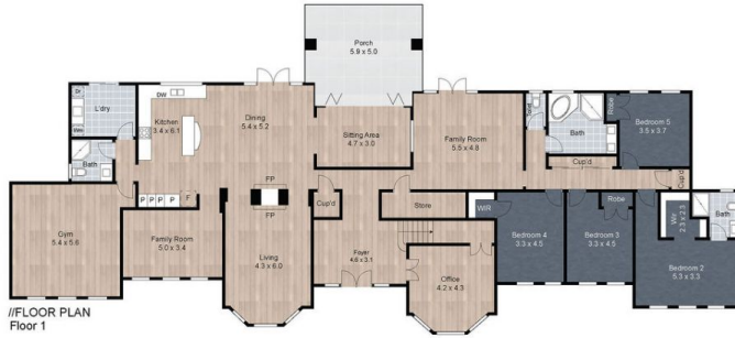
//FLOOR PLAN Floor 1