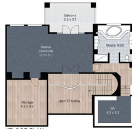
//FLOOR PLAN Floor 2